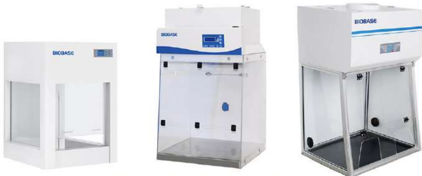
BBS-V500 & BYKG-VII