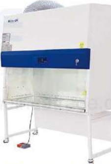
Color Touch Screen Type