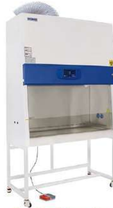
Color Touch Screen Type