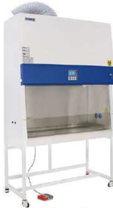
Button Screen Type