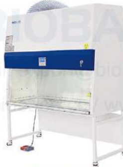
Button Screen Type